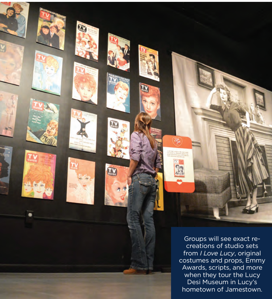
Groups will see exact recreations of studio sets from I Love Lucy , original costumes and props, Emmy Awards, scripts, and more when they tour the Lucy Desi Museum in Lucy's hometown of Jamestown.

For nine weeks every summer, groups can experience education, lectures, art, entertainment, recreation, and more. And what better way to enhance your group's inspirational adventure than by exploring Chautauqua Institution's stunning gardens, American architecture dating back to the late 1800s, top-notch sailing facilities, and award-winning golf club with two 18-hole courses? For help planning your group tour, including lodging, dining, and the 2024 calendar of lecture topics and events, visit chq.org .