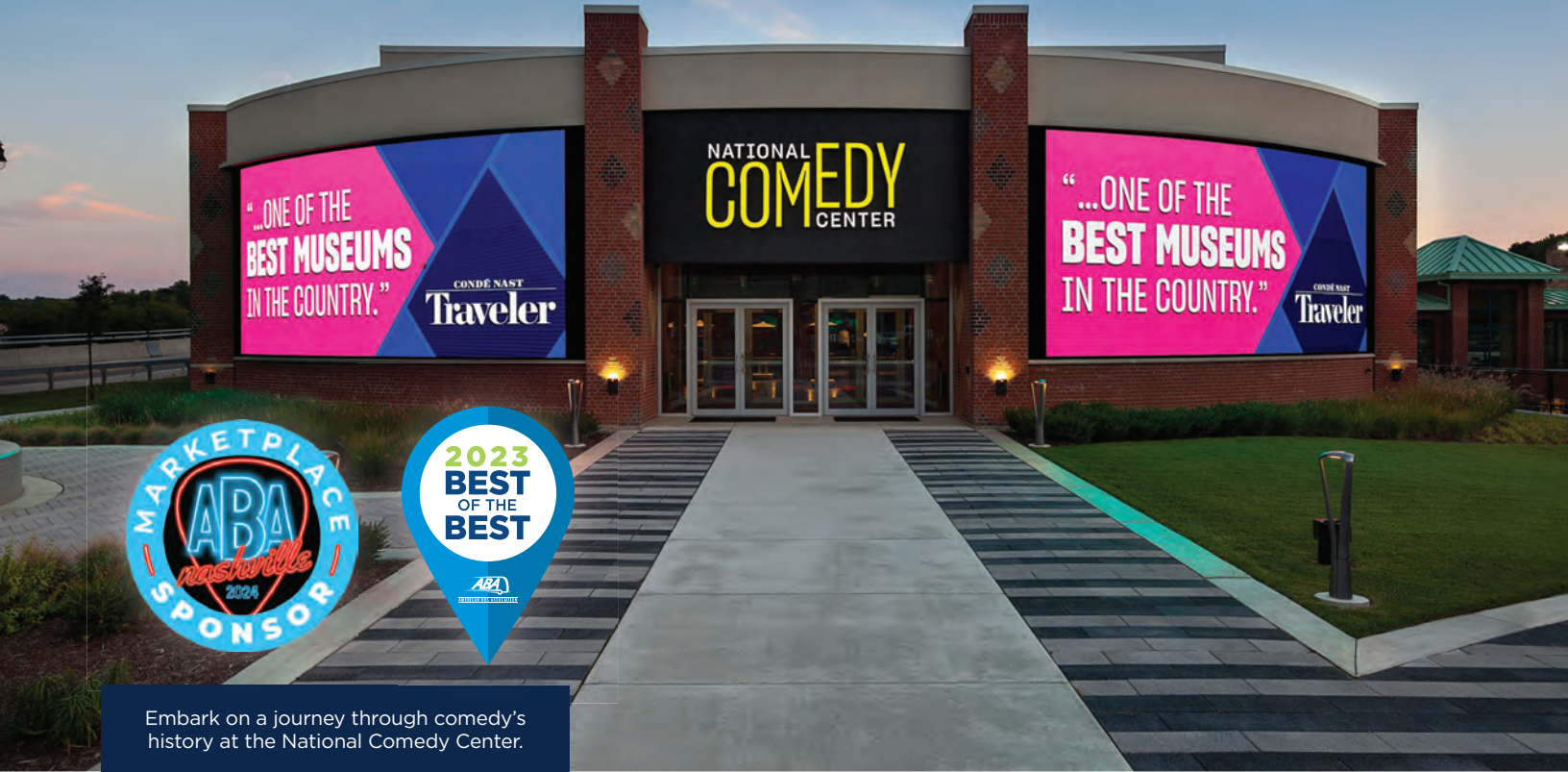
Embark on a journey through comedy's history at the National Comedy Center.