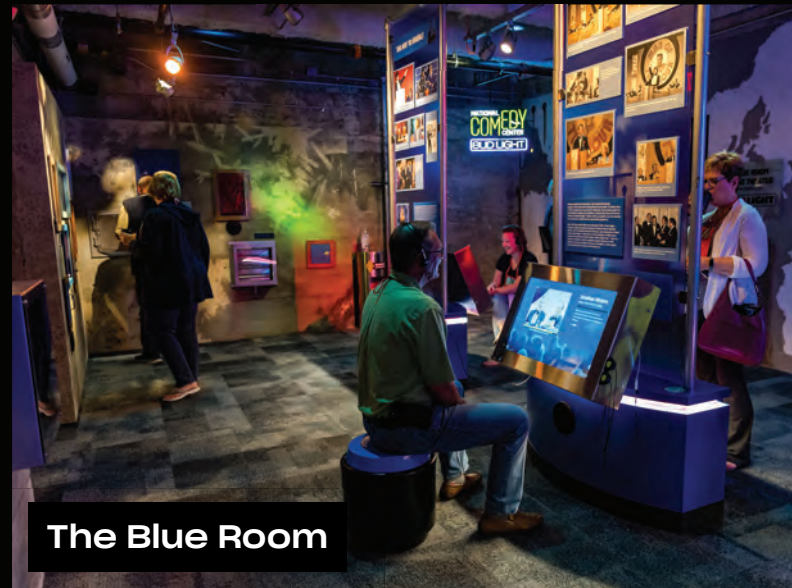
The Blue Room