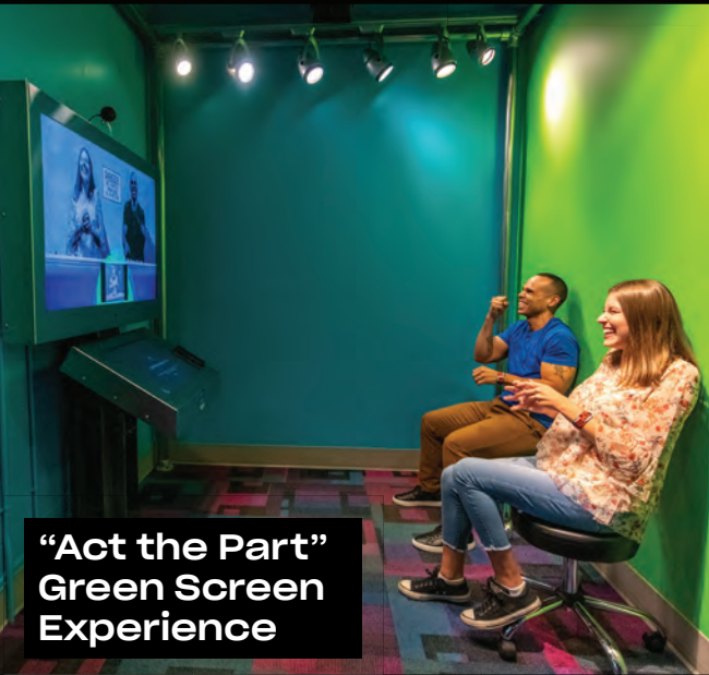
"Act the Part" Green Screen Experience