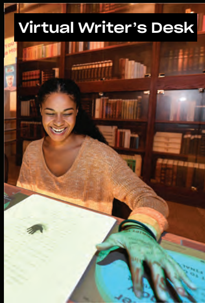
Virtual Writer's Desk