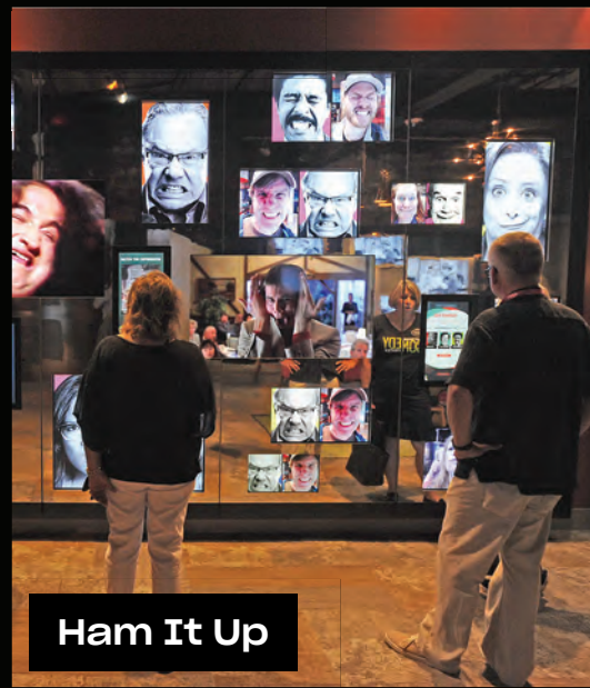
Ham It Up